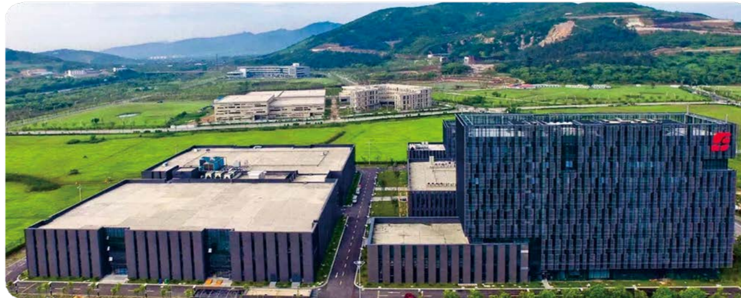
State-of-the-art manufacturing facilities.

WHEN YOU PUT PATIENTS' HEALTH FIRST, REMARKABLE THINGS FOLLOW