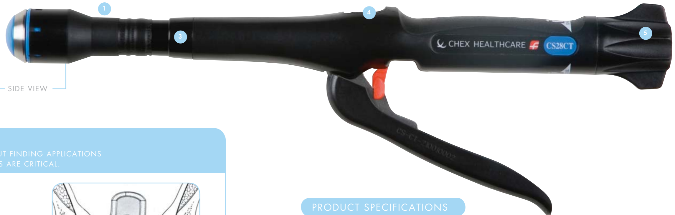
THE CHEX™ CS COMPACT™ CIRCULAR STAPLER ACTUAL SIZE